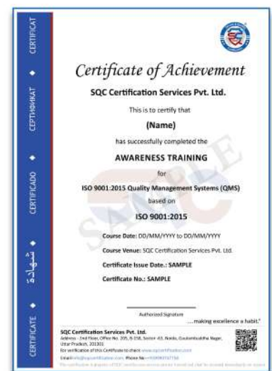
(Awareness Training Certificate)