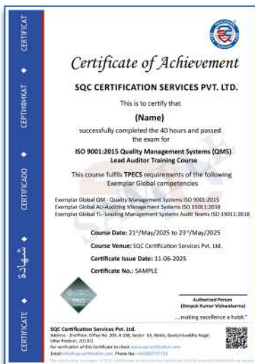
(Lead Auditor Certificate)