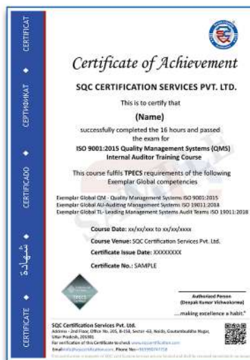
(Internal Auditor Certificate)